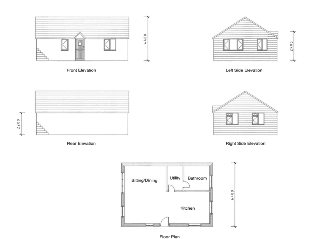
Figure 2: Plan and Elevation

1.4 At the time of writing this report, there are two static caravans on the site, but these are not in the location shown on the proposed Site Layout Plan. They are sited partly across the location of the eastern hedgerow, as shown on the layout plan, orientated east-west. It is assumed these two would be re-positioned should permission be granted.